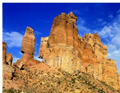
Figure 4. The Red Canyon of Sharyn.

The vegetation cover of this site is represented by sparse xerophytic-cereal-shrub vegetation on alluvial meadow soils. The vegetation cover of the geobotanical site is formed by Astragalus Sharynsky , Libanotis iliensis , Populus pruinosa , and Kolpakovsky tulip [13, 14]. In some areas, design coverage can reach 55%.