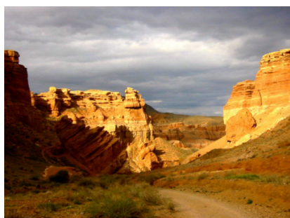
Figure 3. Moyntukay Valley with Canyons.

The critical area No. 2, the Moyyntokay Valley ( 43^{\circ}24.231/N ; 79^{\circ}10.218/E ), is located 1,121 m above sea level. Sharyn canyons in the tract of Moyyntokay (figure 3) with morphological sculptures (figure 4) are found from the Sharyn River's exit from the gorge to the mouth of Temirlik. Streams cut canyons and narrow valleys into sedimentary rocks aged about 12 million years. The height of the steep walls of the canyons reaches 150–300 m. Some canyons are oriented perpendicular to the strike of the Sharyn River valley. The length of one of the most picturesque canyons, the Red Canyon, is about 3 km, a width – 20–130 m, a depth – 100–200 m [6].