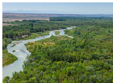
Figure 2. Relict Grove ash Sogdian.

The critical area No. 2, the Moyyntokay Valley ( 43^{\circ}24.231/N ; 79^{\circ}10.218/E ), is located 1,121 m above sea level. Sharyn canyons in the tract of Moyyntokay (figure 3) with morphological sculptures (figure 4) are found from the Sharyn River's exit from the gorge to the mouth of Temirlik. Streams cut canyons and narrow valleys into sedimentary rocks aged about 12 million years. The height of the steep walls of the canyons reaches 150–300 m. Some canyons are oriented perpendicular to the strike of the Sharyn River valley. The length of one of the most picturesque canyons, the Red Canyon, is about 3 km, a width – 20–130 m, a depth – 100–200 m [6].