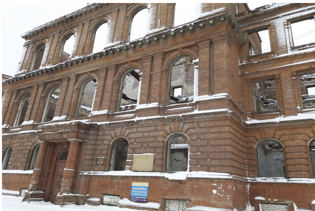
Figure 7. Current view of the former Semey Veterinary Institute building.

Currently, the state of architectural monuments with historical values in the city of Semey is critical. Suffice it to mention as an example the fate of the former Semey Veterinary Institute. This building is unique with its architectural and stylistic features and obviously a very valuable architectural object, that does not have got any analogues not only in Kazakhstan but also in other neighboring countries, including Russia [4,5].