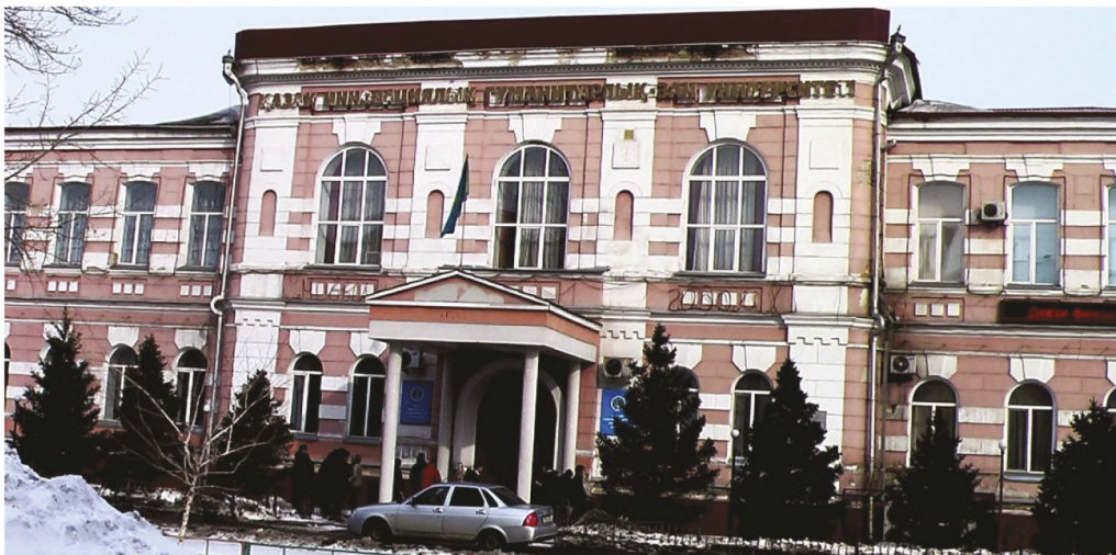
Figure 1. The building of the Kazakh Humanitarian Law Innovative University, before restoration.

This building is notable for its uniqueness and historical value not only in the city of Semey, but also at the national level. (Figure 1).