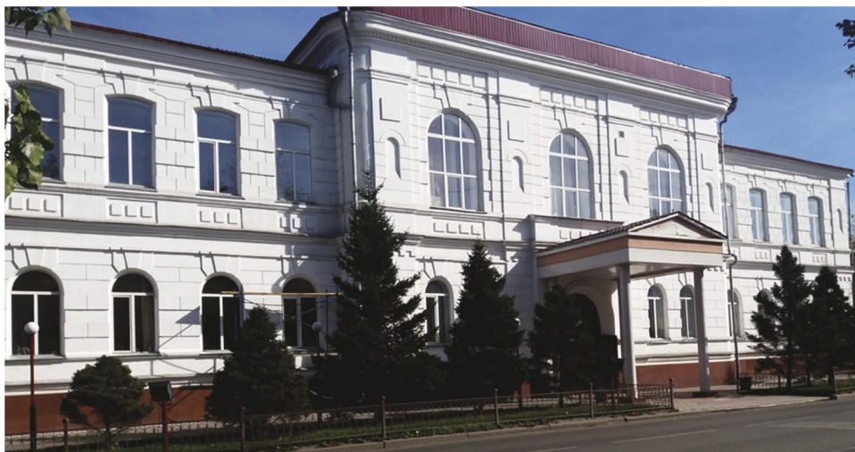
Figure 2. The building of the Kazakh Humanitarian Law Innovative University, after restoration.

Restoration is not an easy task that can be done in a short time, so research work and restoration work go hand in hand here. Because in reconstruction, namely in the modernization of historic buildings, other additional types of work of varying degrees of complexity is involved. Much of the work is done by hand, with great patience and precision, and requires not only professional skill, but also deep knowledge of history and architecture [1,3]. (Figure 2).