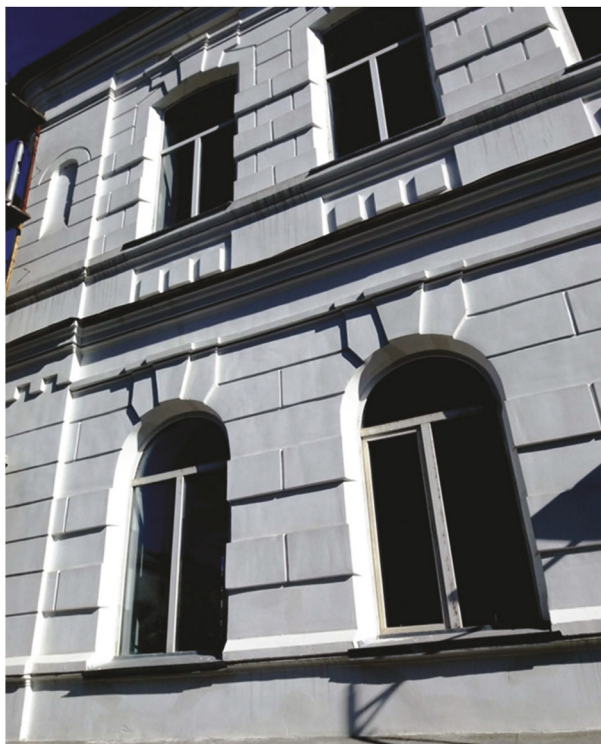
Figure 4. The building of the Kazakh Humanitarian Law Innovative University, after restoration (fragment).

When the building was reconstructed, tiles of various shapes were made and used on the basis of previous architectural elements in order to preserve the artistic and stylistic features of its facade.(Figure 6) In spite of the long period of use, the building has survived to this day in reasonably good condition [1,5].