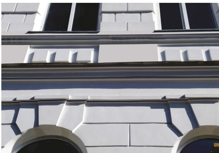
Figure 5. The building of the Kazakh Humanitarian Law Innovative University, after restoration (fragment)