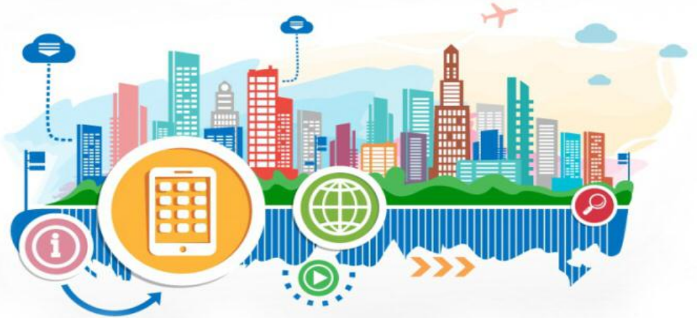
Figure 3 – Smart City

Also, one of the tasks is aimed at creating smart cities. This task has already started to some extent. The same heated stops that also have access to Wi-Fi. Lights that are automatically switched on and off at the sight of any figures, thereby saving energy. These, though small, are significant steps towards a full digital civilization.