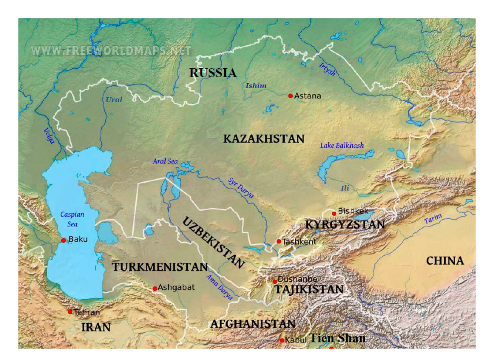
Figure 1. Central Asia with major regional water resources [8].

manage the natural resources. Even though different multilateral treaties have been agreed upon between the Central Asian states over the years to ascertain this resource-sharing regime, conflicts have arisen. For example, repeated conflicts between Kyrgyzstan and Uzbekistan have occurred due to problems in this resource sharing. For a more detailed discussion on this topic, see Dinar [4]. Once the Soviet Union had disintegrated, water resources became politicized and part of the national interests [5]. For example, during a presidential meeting in Astana in 2012, the Uzbek president Islam Karimov emphasized that water resources problems could cause wars [6]. Recent research on the possible reduction of water supply from melting of the Tien Shan glaciers (Figure 1) has resurfaced the fear of water wars in Central Asia [7]. The passing of president Karimov on 2 September 2016 raises important questions for the future of the region with the intertwined water issue.