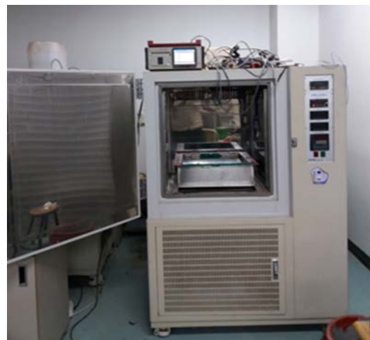
Figure 4. Freezing camera.