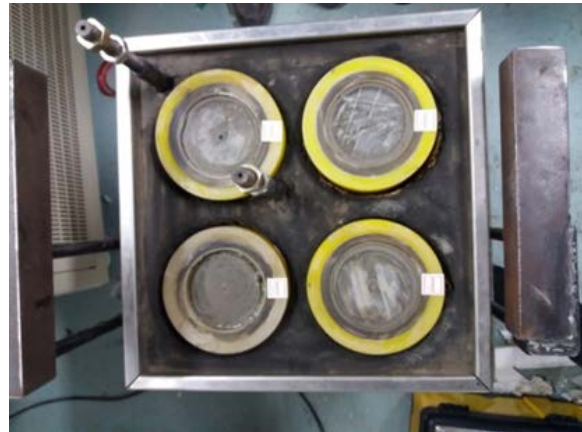
Figure 2. Four samples in freezing box.

The sensors of the decal and thermocouple were connected to the data logger automatic measuring equipment. In addition, the TDR probe floating water was measured by connecting to a laptop and measured by a measuring program. All the data were measured at intervals of 1 hour (Figure 4).