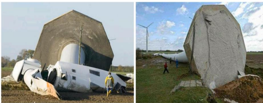
Figure 2. Wind turbine foundation failure

foundation modeling [5] with special attention to their displacement, acceleration and response to internal force under combined stochastic wind and wave loads.