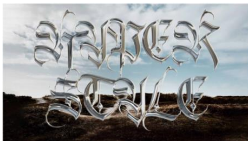
Сур.1 сұйық металл және хром дизайнда қолдану

Сұйық «сынап» қаріптері. Екі жылдық карантиннен кейін барлығына шығармашылық өмірдің жаңа тарауының жақындағанын сезіну үшін жаңа нәрсе қажет болды. Сұйық металл мен хром типографиясының 3D дизайны мен тренді пайда болды. Бұл стильде көптеген дизайн тұжырымдамалары тоғысады: 2000-шы жылдардағы стильді өмірге қайтару арқылы дизайнерлер адамзатқа аздап оптимизм мен жарқын болашаққа деген сенімділікті оятуға тырысады. 3D өнері шабытты оятатын таңқаларлық, эмоционалды формалары үшін жақсы көреді. Ал балқитын металл текстуралар үлкен магнит сияқты жұмыс істейді, өйткені оларды мәңгілікке қарауға болады. Биылғы жылы түсінікті қаріптер басымдыққа ие болса да, эксперименттік типографияның орны әлі де бар.